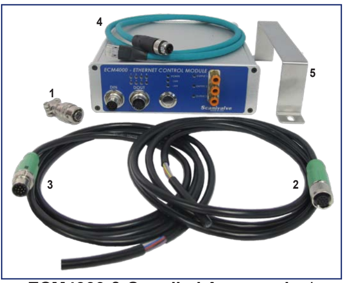
ECM4000 & Supplied Accessories*

The ECM4000 is provided with most accessories required for operation: a mating connector is provided for the power connector (1), 1m long cables with flying leads are provided for the digital input (2) and digital output (3) connectors, a 1m long Ethernet cable (4) is provided for communication, and a stainless steel mounting strap (5) is provided to secure the ECM4000. Power requirements are wide (9-36Vdc) so most DC power sources will work to power the ECM4000.