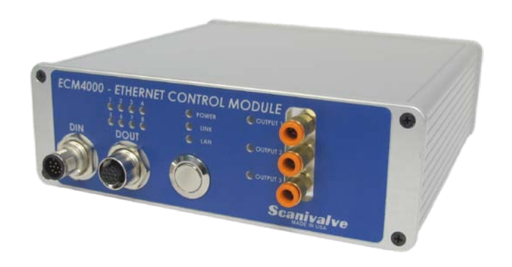
ECM4000 - Ethernet Control Module